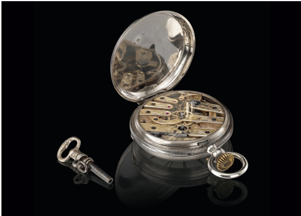
A Girard-Perregaux pocket watch from 1875 - A Property of the Girard-Perregaux Museum

Properties of the Girard-Perregaux Museum, these timepieces are a priceless testament of the links that have bonded together the Chaux-de-Fonds Maison and the Japanese archipelago for more than one and a half centuries. Numerous officials and dignitaries, including Georges Martin, Deputy Secretary of State to the Federal Department of Foreign Affairs and M. Yukihiro Nikaido, Ministre and Chargé d'affaires a.i, attended the commemorative ceremony.