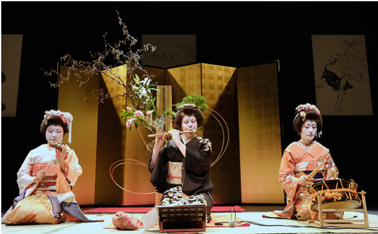
MEN exhibition opening performance (in partnership with

The introductory part of this exhibition organized by the MEN was unveiled on the historically significant date of February 6, 2014, the official 150-year commemoration of the Treaty of Amity and Commerce between Switzerland and Japan.